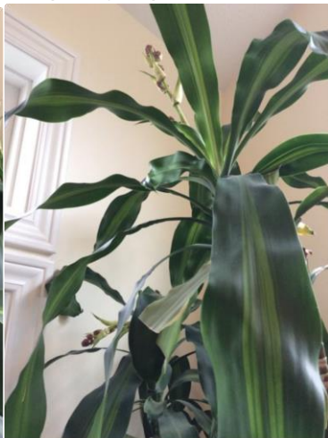
Second view, October 2014

seen immense change. It generally blooms every year with lowers that have a sweet jasmine-like fragrance. It did not bloom at all last year (2013). This year (2014) it has huge blooms, and the fragrance is sweeter and stronger, and fills every room of the house. The photos below show a corn plant on arrival in August 2013, in October 2013 and in bloom in October 2014.