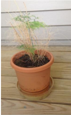
Fern, August 2013

CC1.2 Plant tonic + CC15.1 Mental & Emotional tonic...3TW in water.