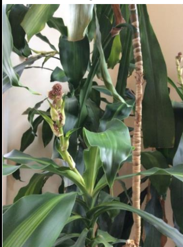
In bloom, October 2014