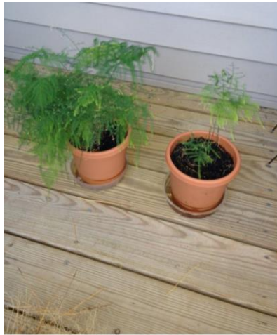
On right, October 2013