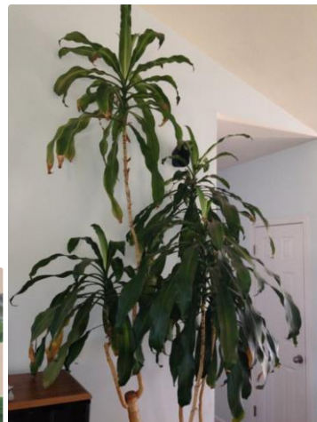
Corn plant, August 2013

More than a year later, the plants are bright green and seem to have almost doubled in size! The difference can be seen particularly in the photos of one fern. This plant had suffered the most in the move. A striking difference can be seen in the fern plant after the move in August 2013, two months later in October 2013 and one year later in October 2014 the dracaena fragrans (indoor corn plant) in particular has