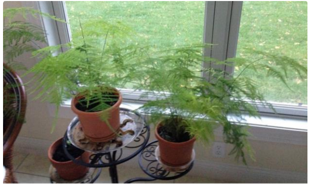
On right, October 2014

After two months' treatment, they had recovered and were flourishing. I would now like to provide an update: