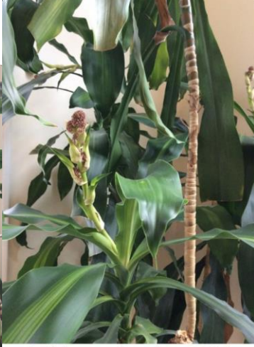
In bloom, October 2014