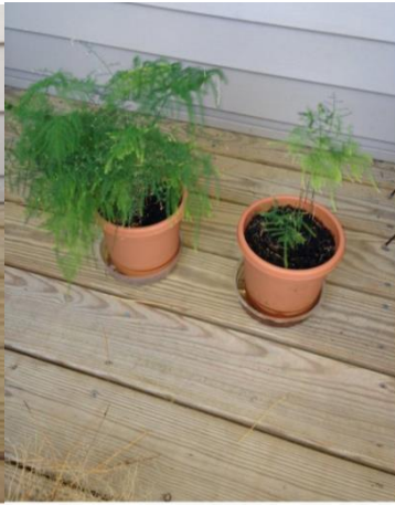
On right, October 2013