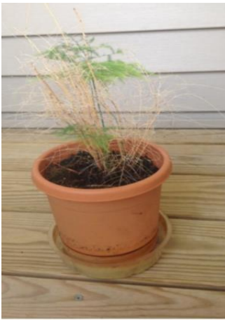
Fern, August 2013