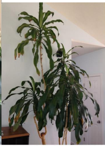
Corn plant, August 2013