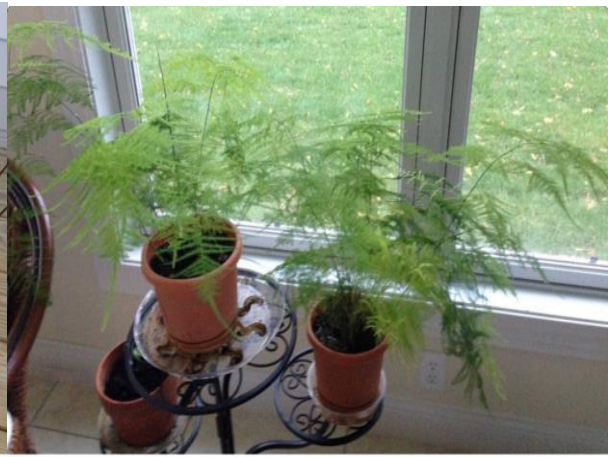
On right, October 2014