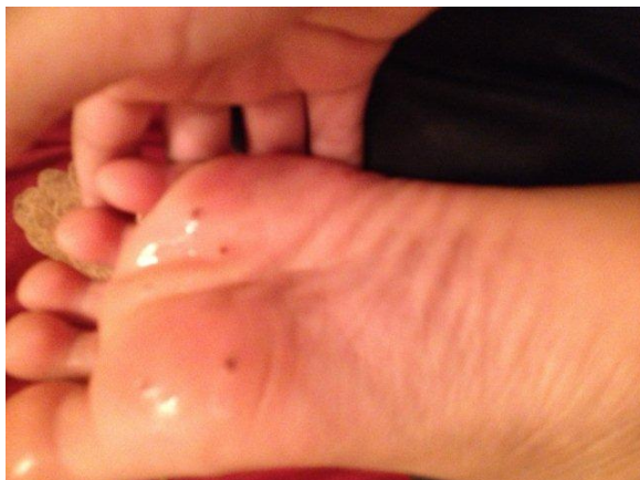
One month after treatment