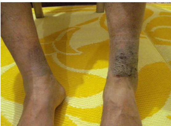
Photograph taken on 08/03/2012