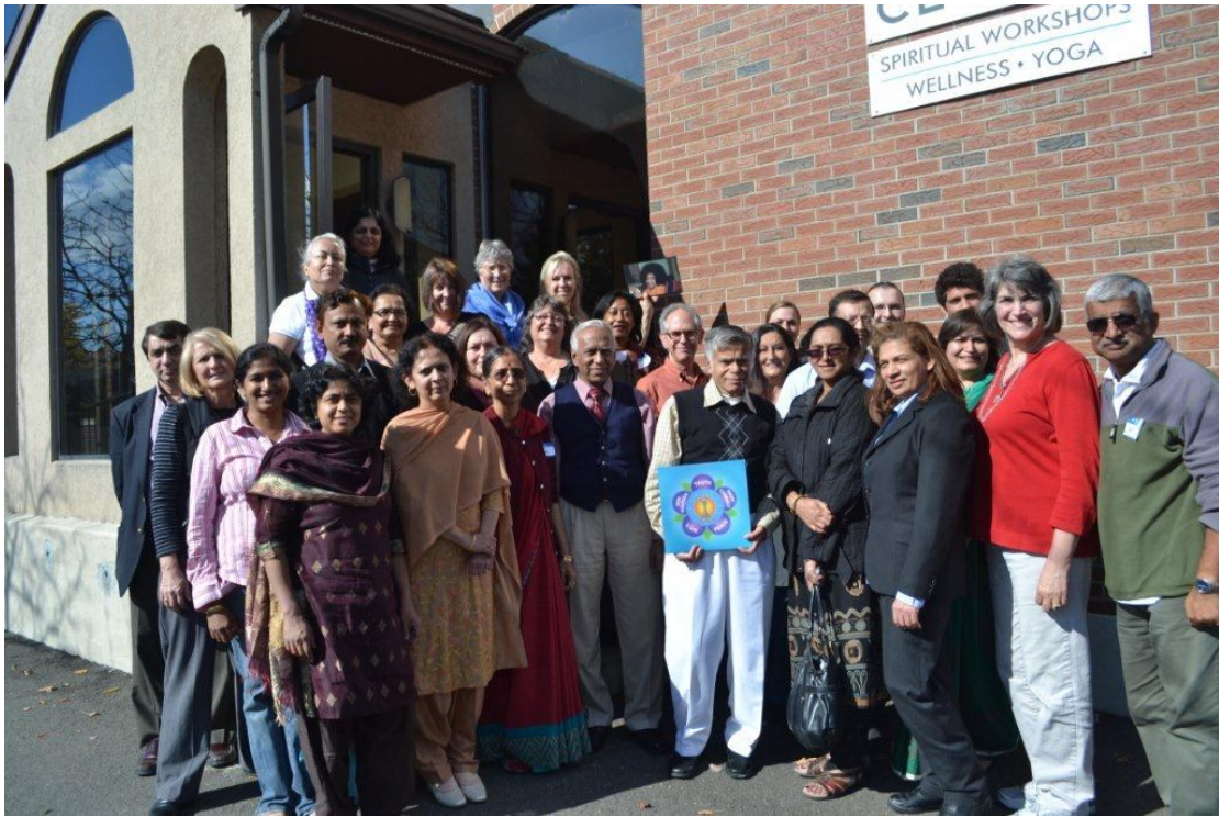
JVP Training Class 20-21 October 2012 in Hartford CT USA