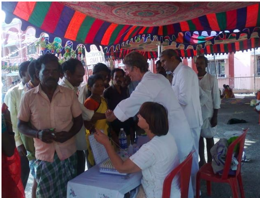
Medical Camp 21-23 November 2012 at PN Railway Station, Puttparthi