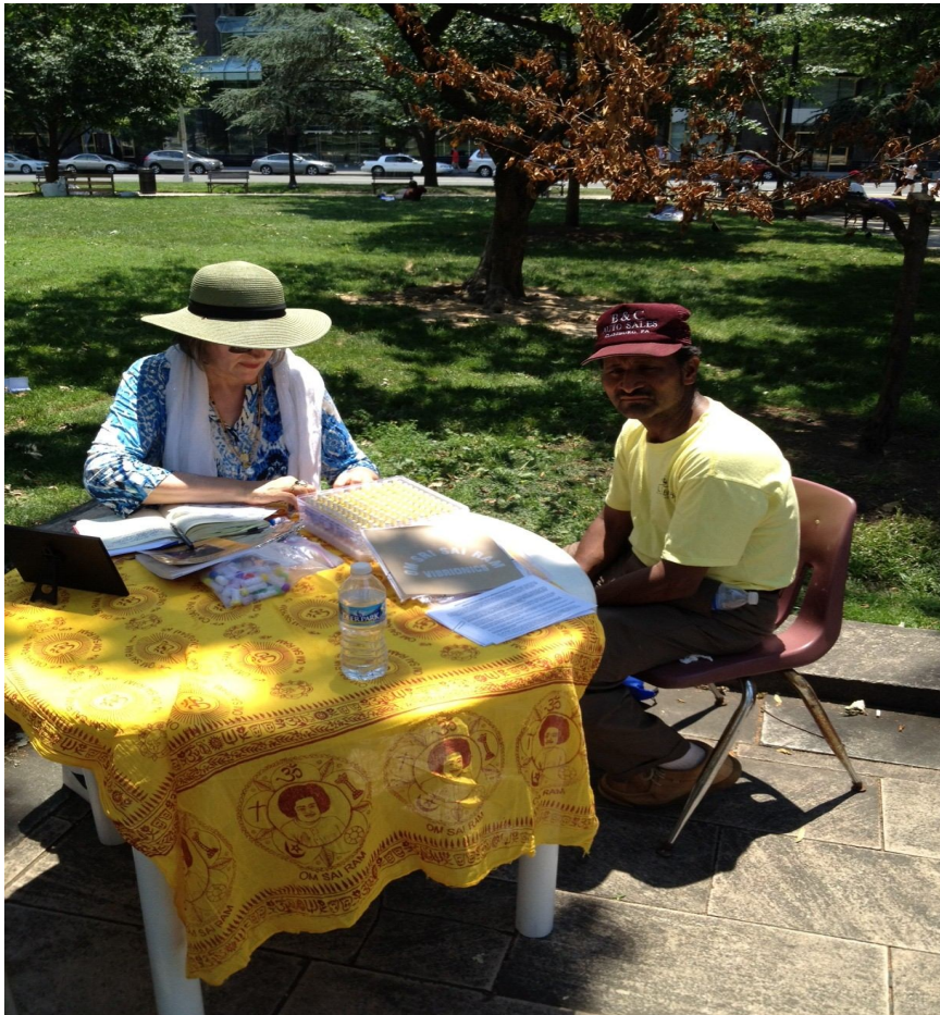
Vibro in Park - Serving the Homeless Washington DC USA