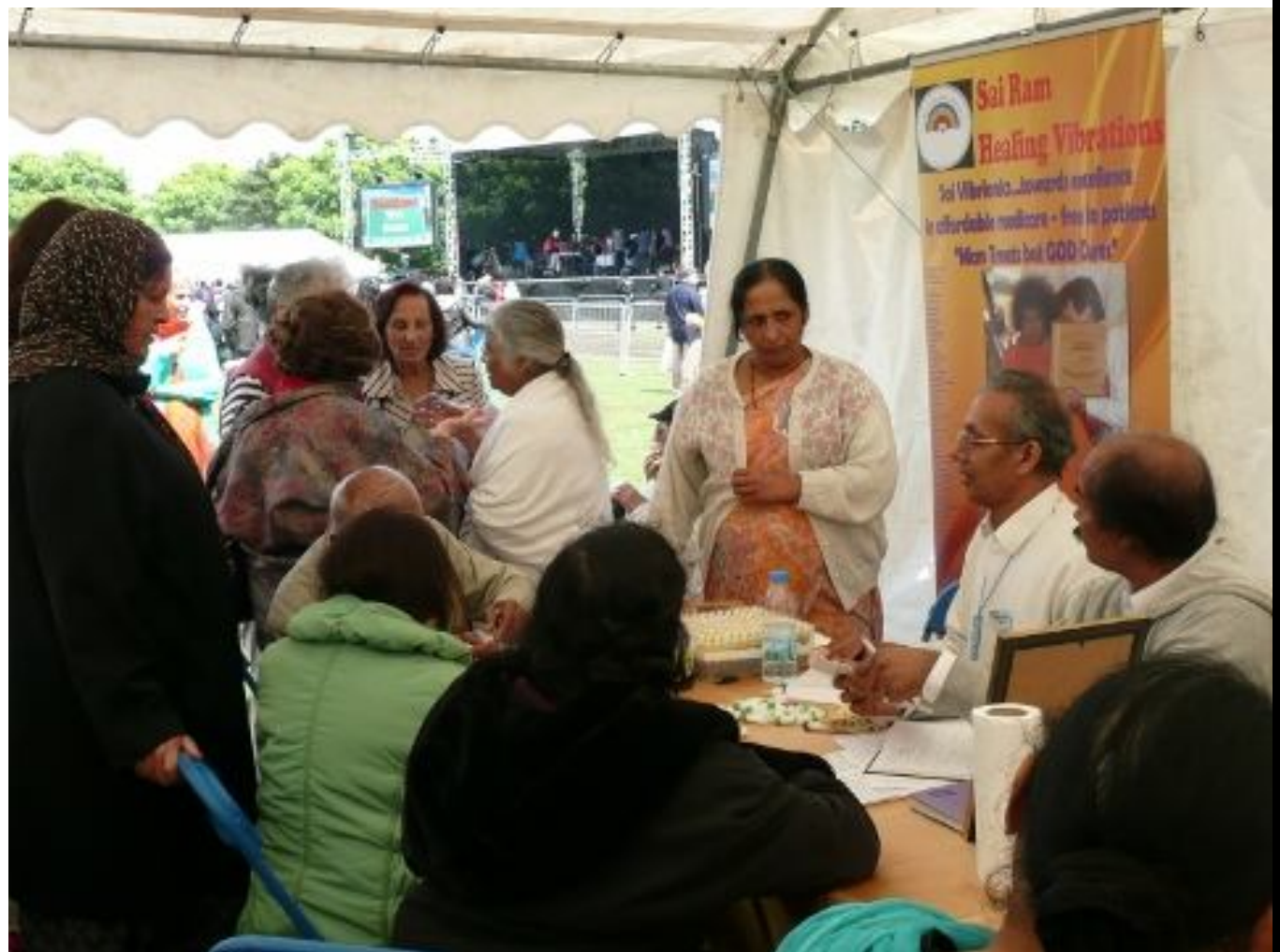
Vibrionics stall at the Unity of Faiths festival in Southall Park, London